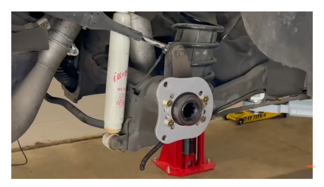
Front of Car→