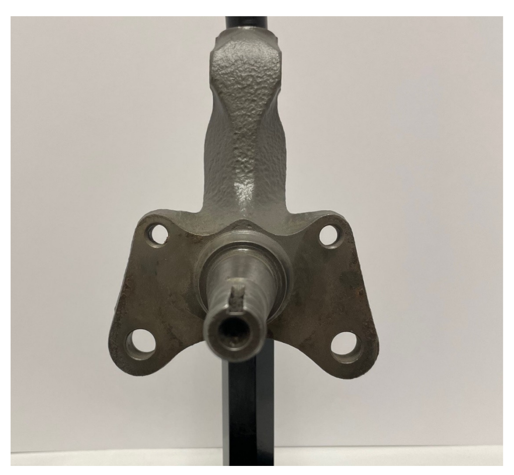
Applications: 1965-72 Chrysler, Dodge and Plymouth C-body cars