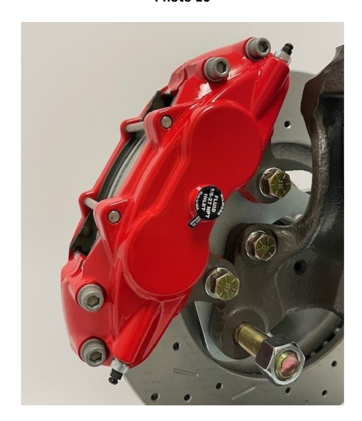
←Front of car