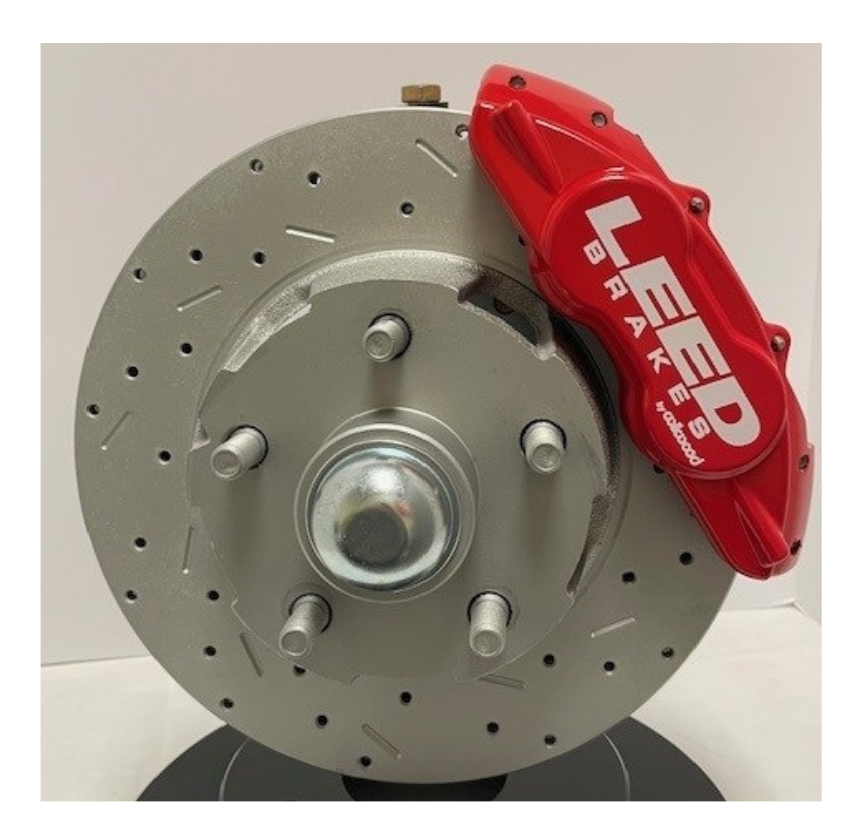
Front of Car→