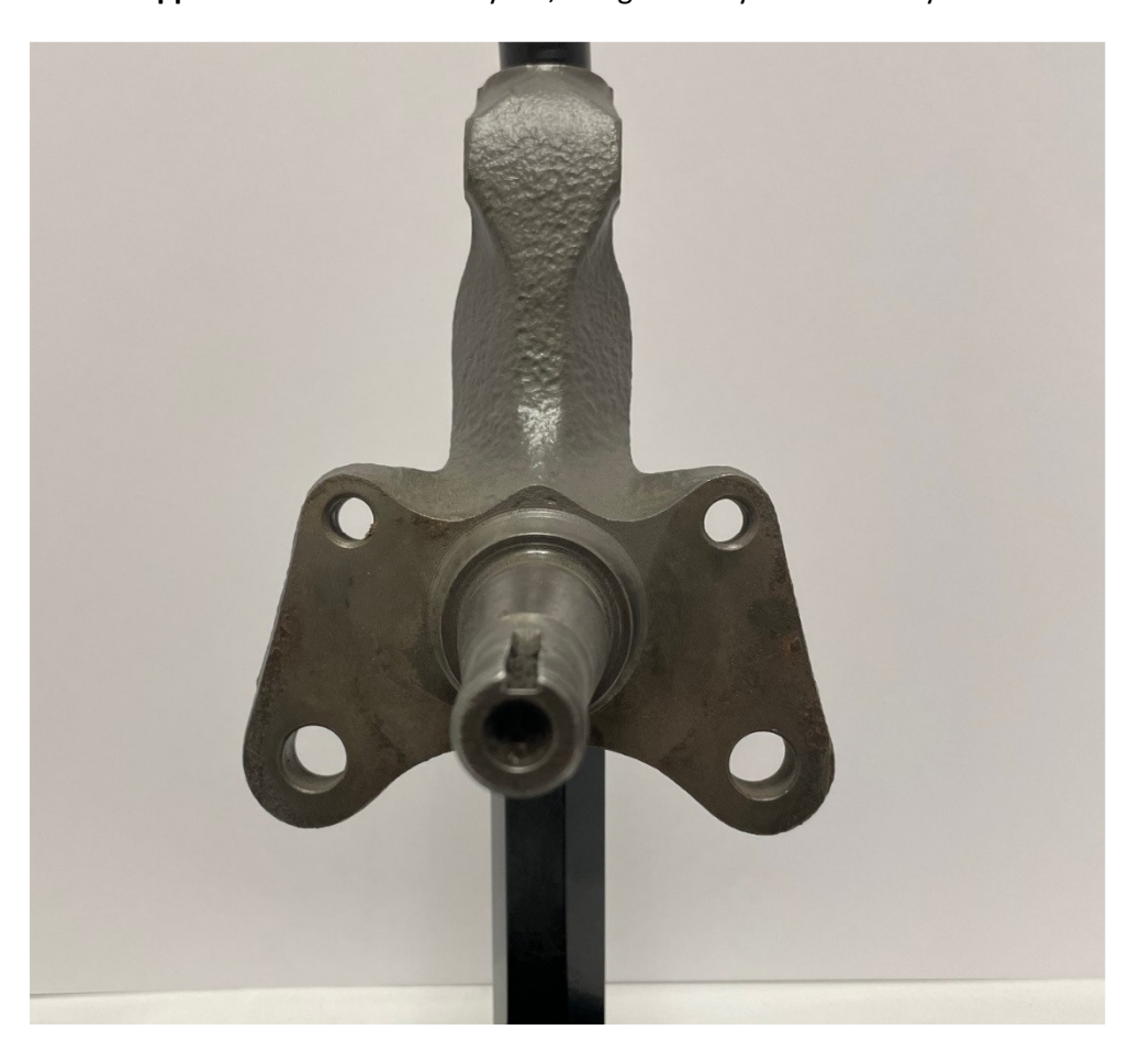
Front of Car→

Applications : 1965-72 Chrysler, Dodge and Plymouth C-body cars