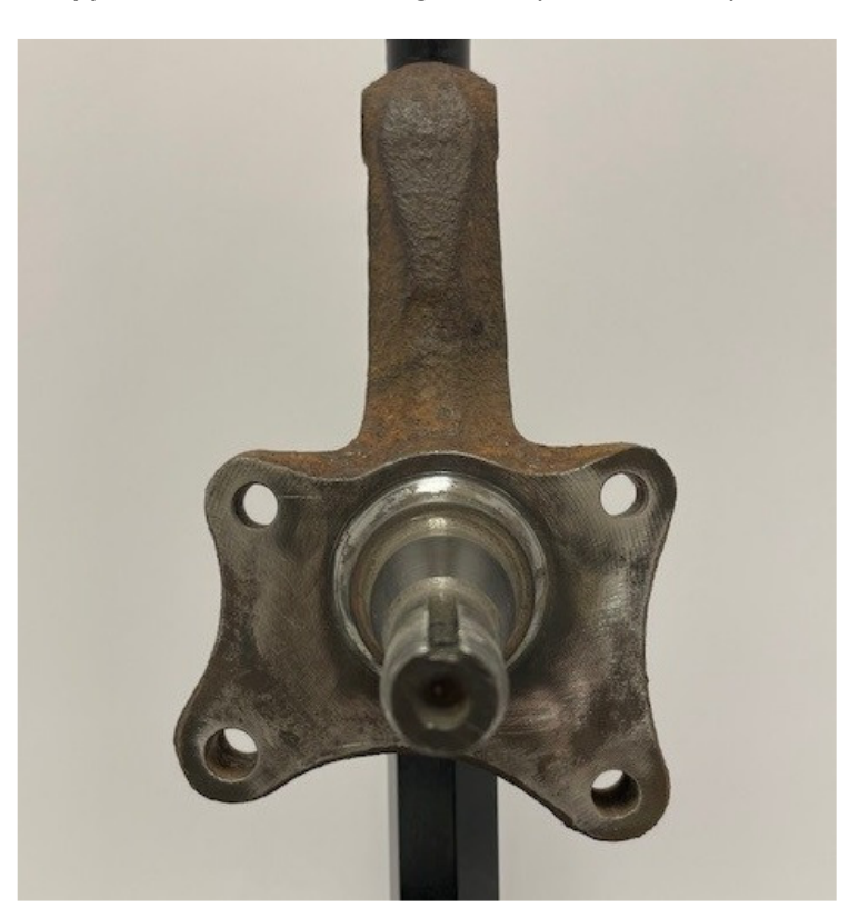
Applications: 1965-72 Dodge and Plymouth A-body cars