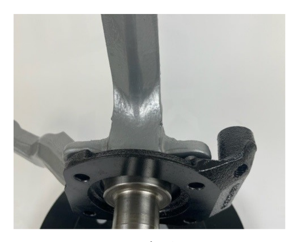
Front of Car →