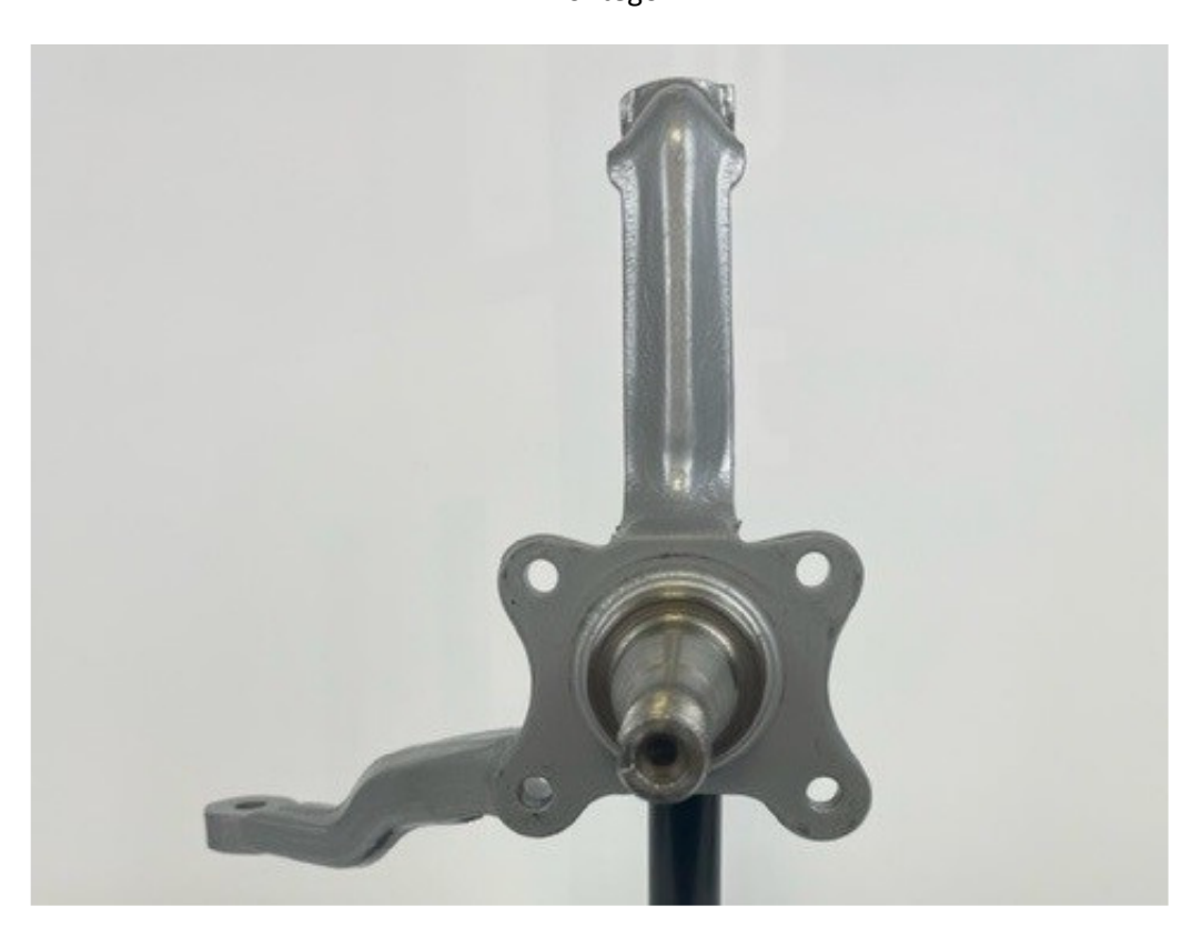
Front of Car \rightarrow

Applications: 64-73 Mustang, 63-69 Falcon, 63-69 Fairlane, Ranchero, Comet, Cyclone, 67-73 Cougar, 68-71 Torino, Montego