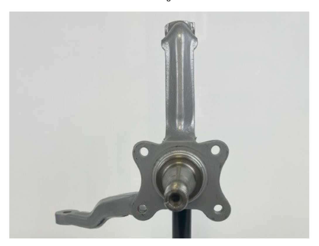
Front of Car \rightarrow

Applications: 64-73 Mustang, 63-69 Falcon, 63-69 Fairlane, Ranchero, Comet, Cyclone, 67-73 Cougar, 68-71 Torino, Montego