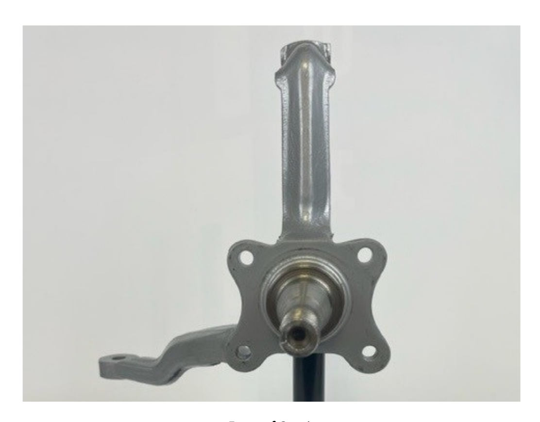
Front of Car →

Applications: 64-73 Mustang, 63-69 Falcon, 63-69 Fairlane, Ranchero, Comet, Cyclone, 67-73 Cougar, 68-71 Torino, Montego