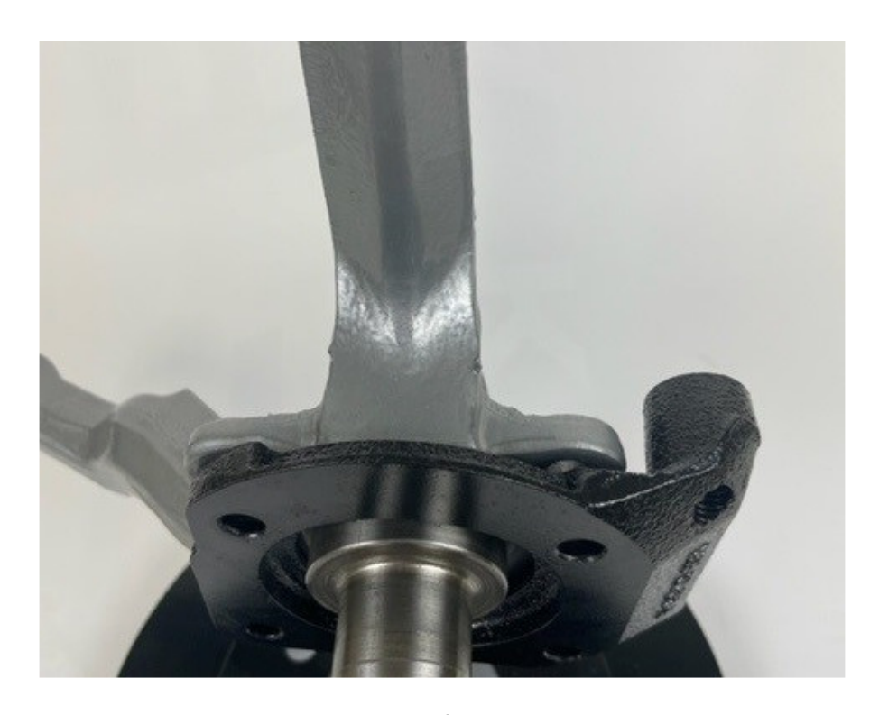
Front of Car →