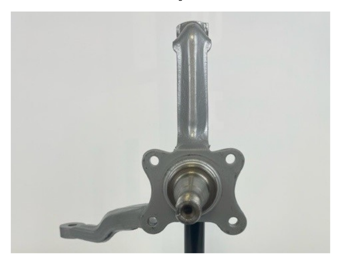
Front of Car →

Applications : 64-73 Mustang, 63-69 Falcon, 63-69 Fairlane, Ranchero, Comet, Cyclone, 67-73 Cougar, 68-71 Torino, Montego