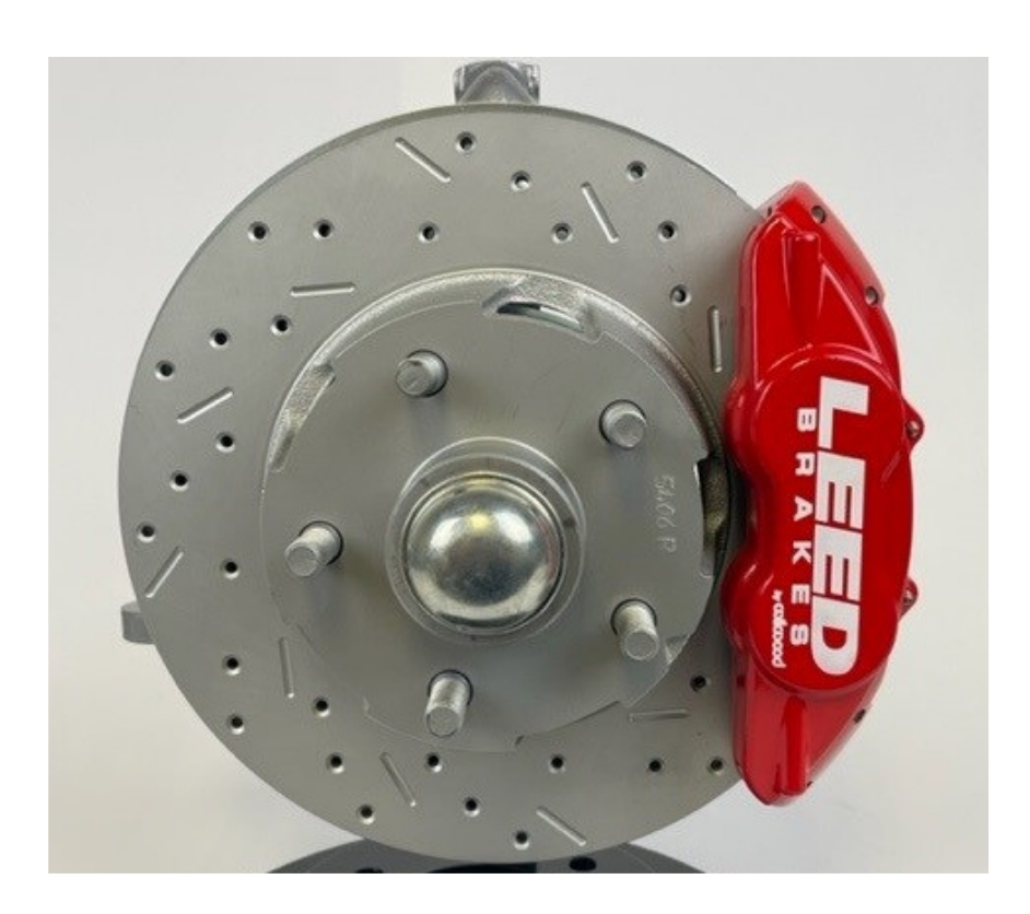
Front of Car →