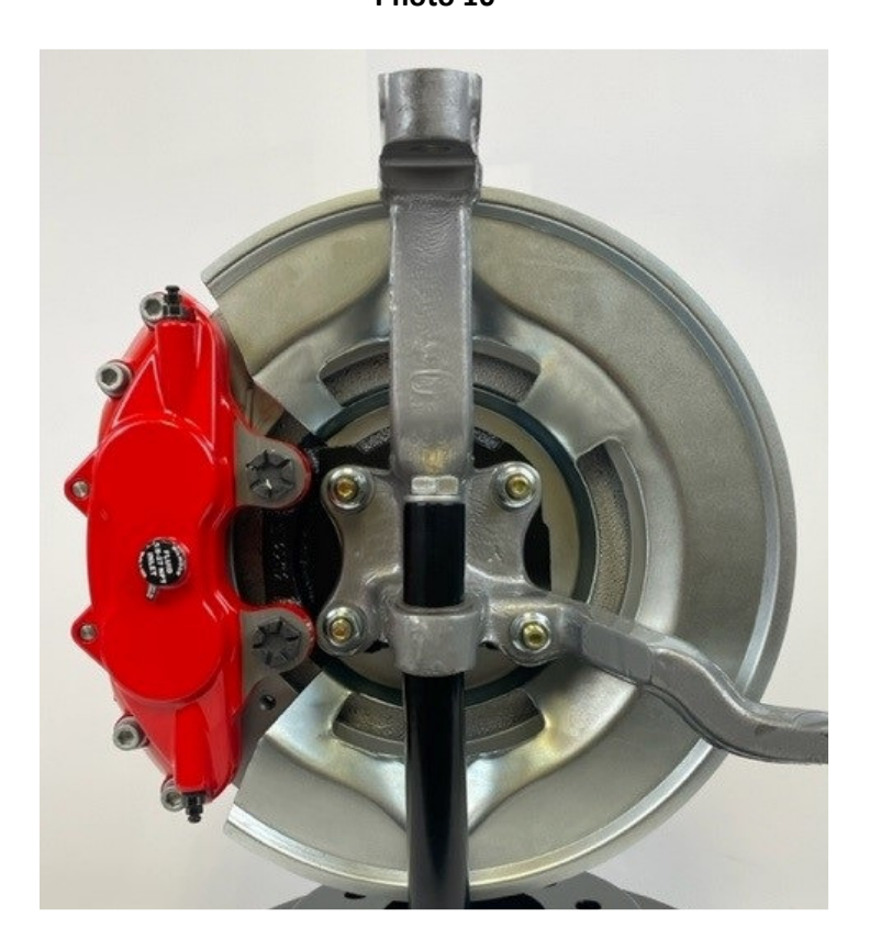
←Front of car