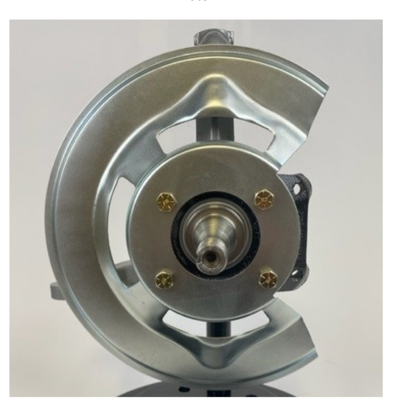
Front of Car →