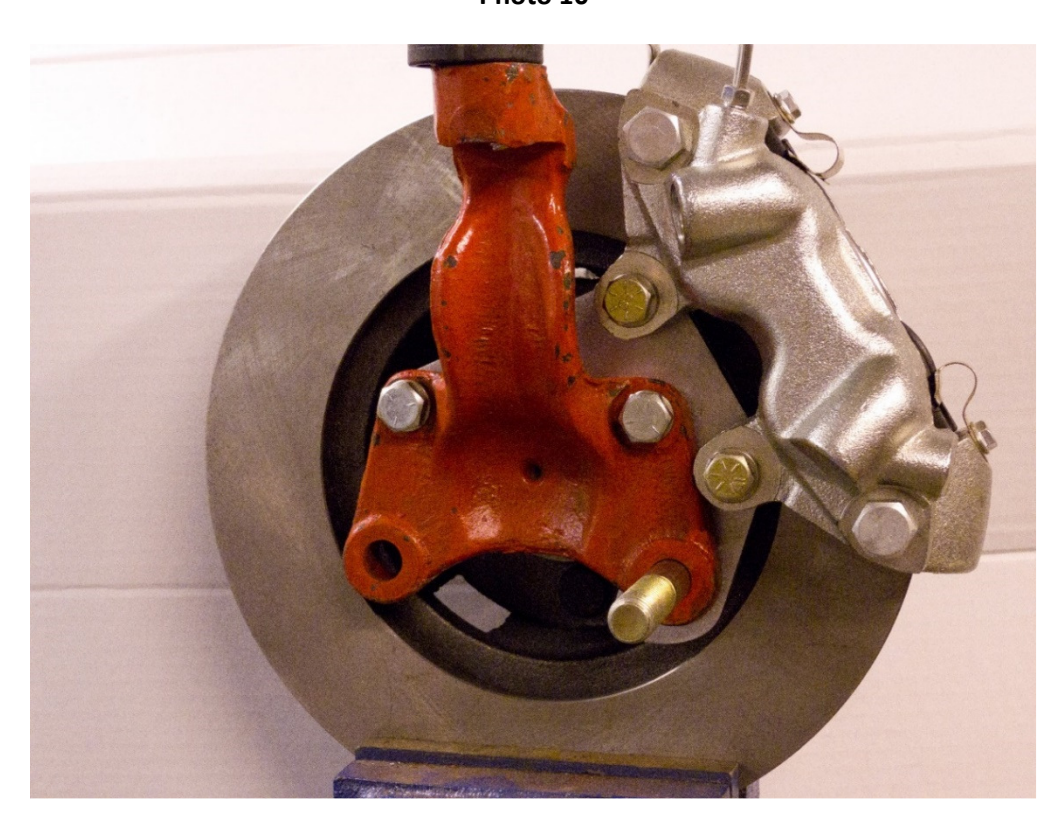
Front of car→