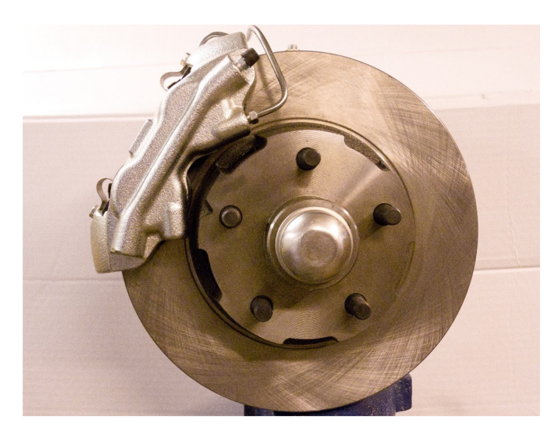
← Front of Car