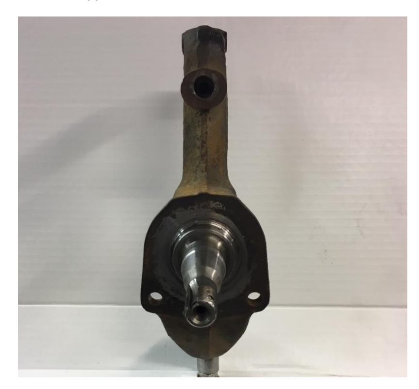
← Front of Car

Applications : 1959-64 Chevrolet Full Size Cars