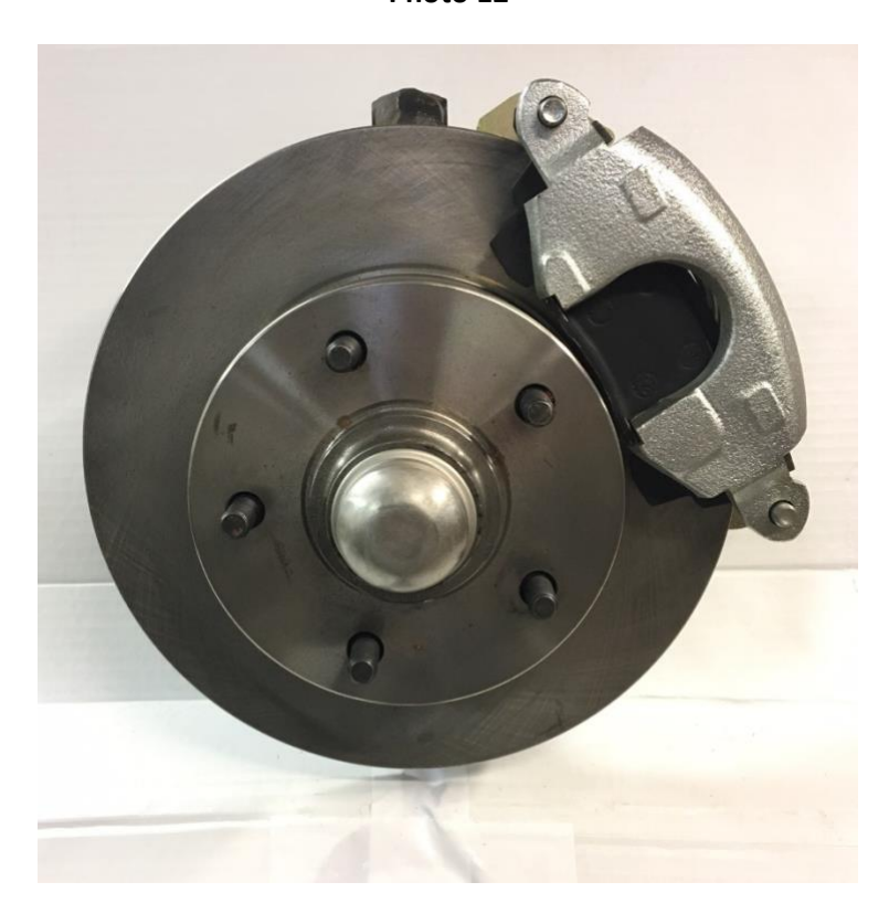
← Front of Car