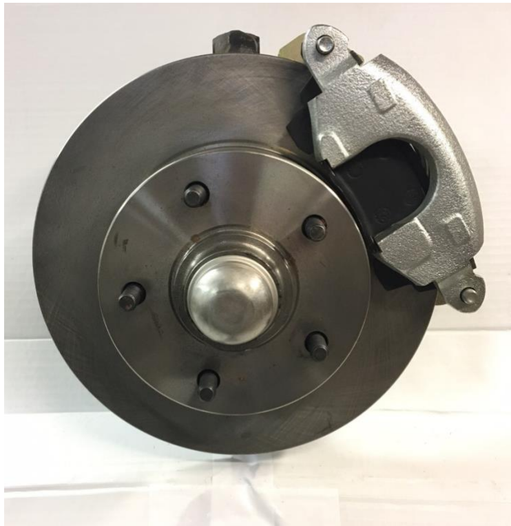
← Front of Car