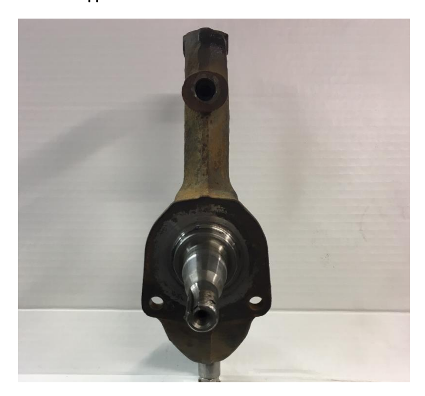
← Front of Car

Applications : 1959-64 Chevrolet Full Size Cars