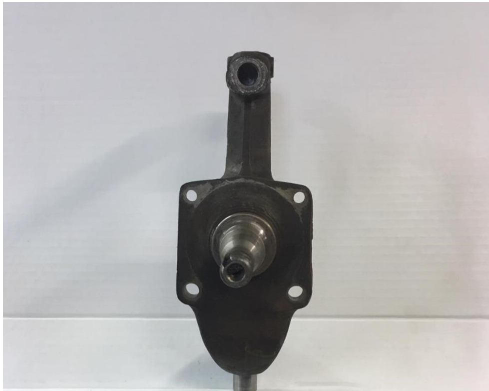
← Front of Car Photo 1

Applications: 1955-58 Chevrolet Full Size Cars