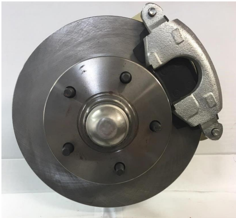
← Front of Car