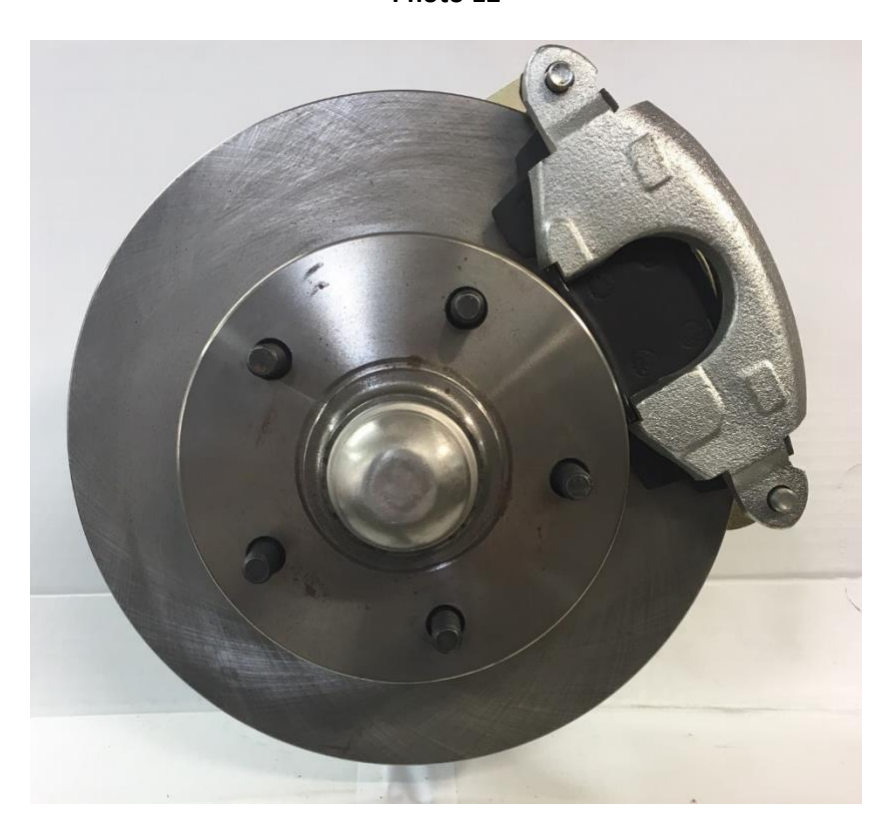
← Front of Car