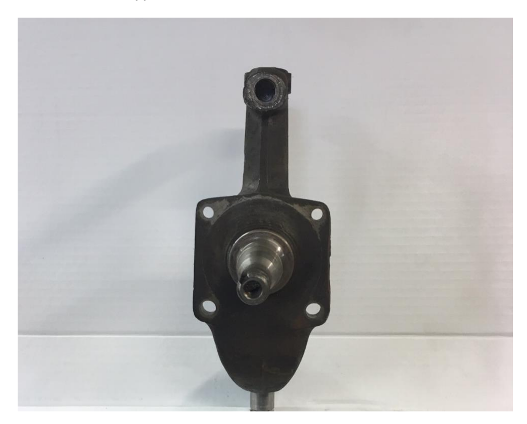
← Front of Car

Applications : 1955-58 Chevrolet Full Size Cars