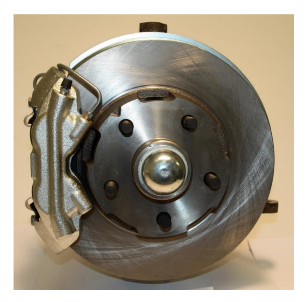
← Front of Car