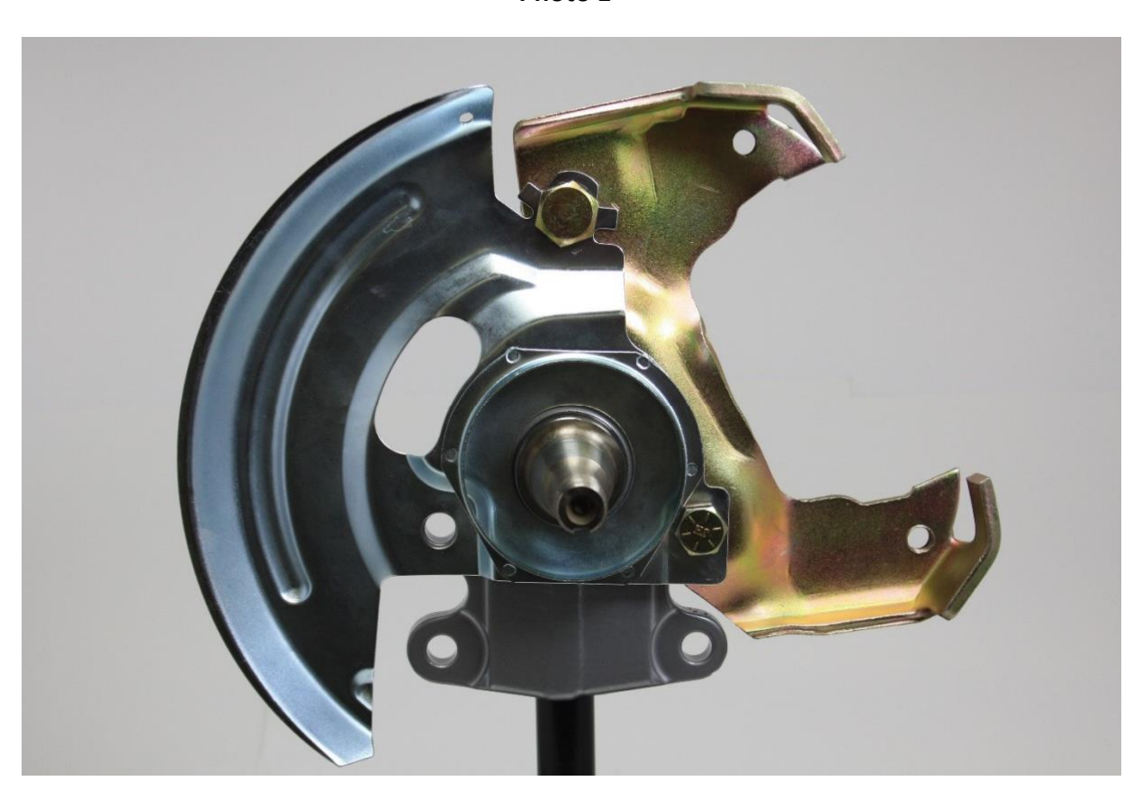
\leftarrow \textbf{Front Of Car}