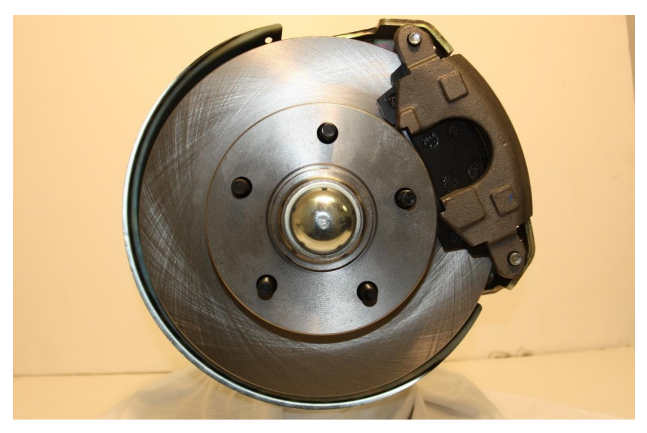
←Front Of Car