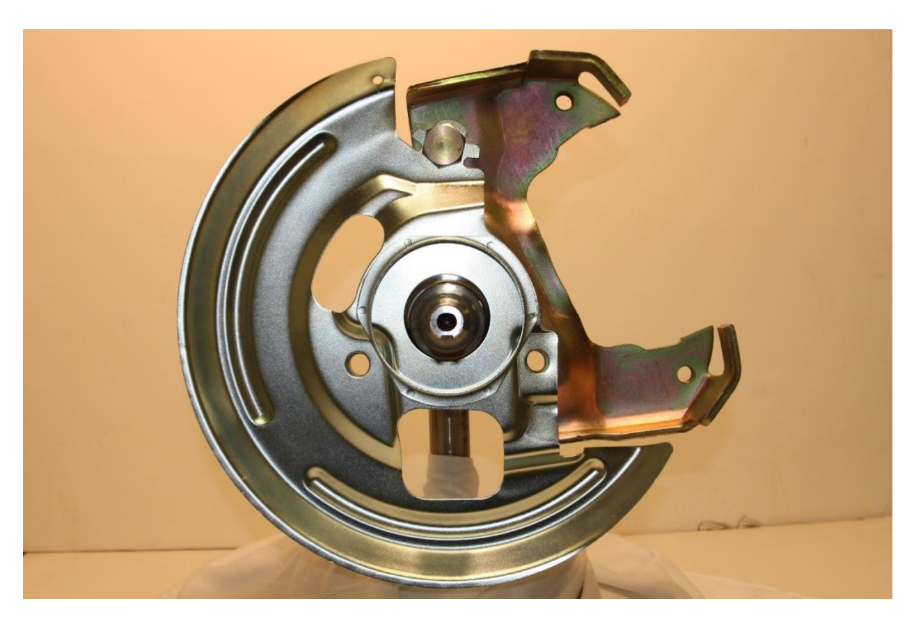
\leftarrow Front Of Car