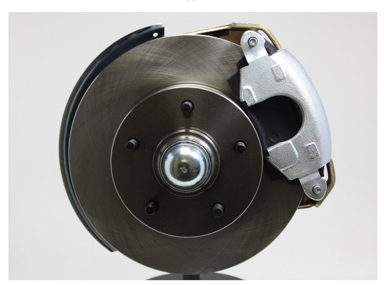
←Front Of Car