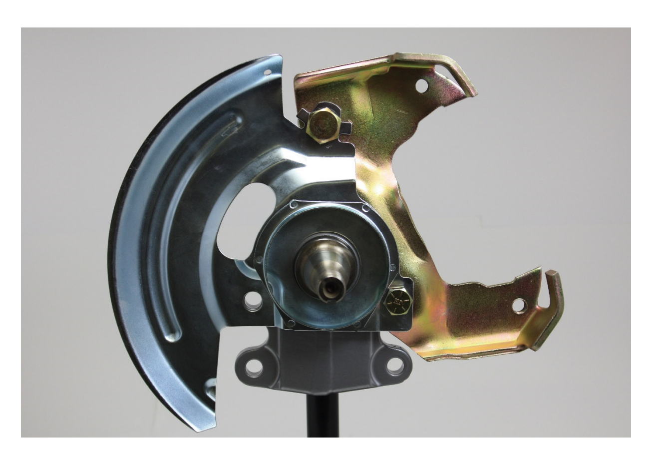
←Front Of Car