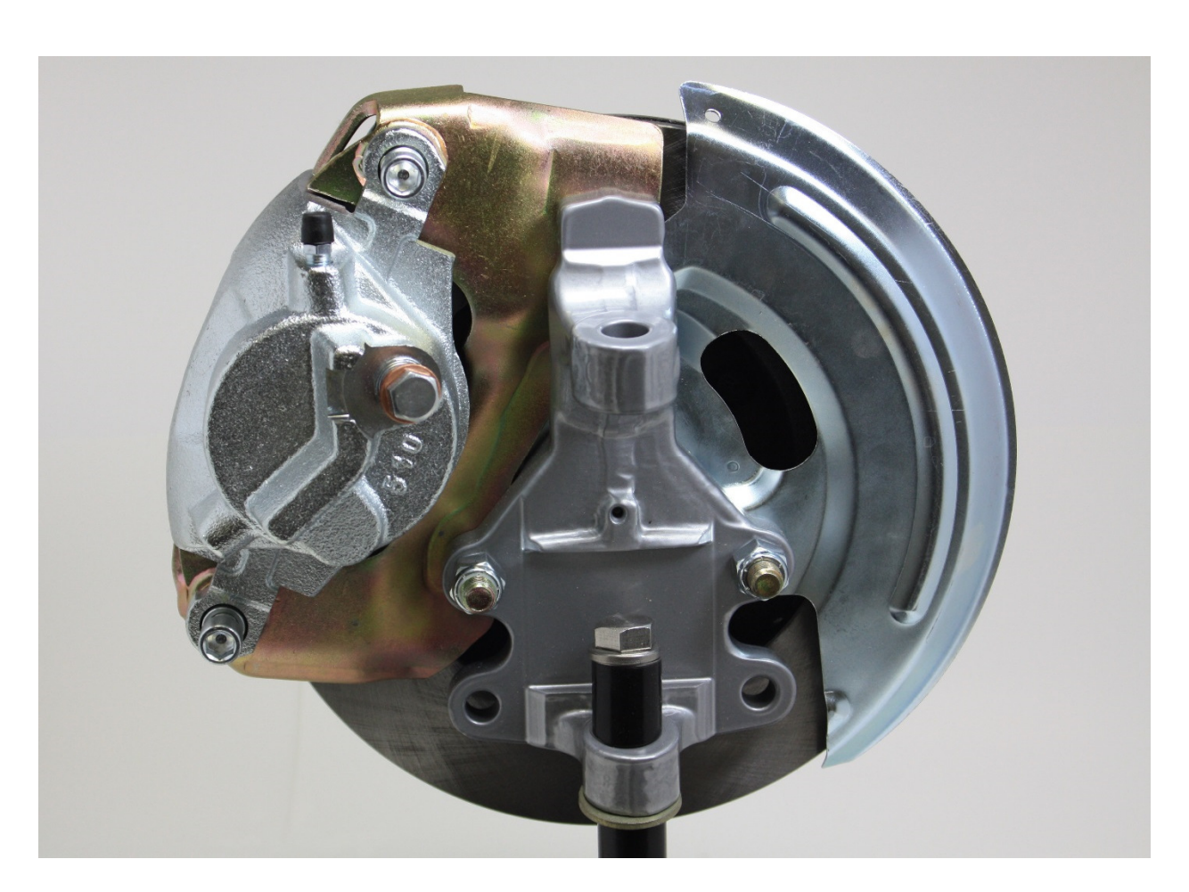
Front Of Car→